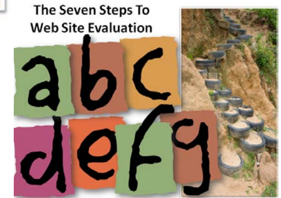
Graphics from Microsoft Word 2007