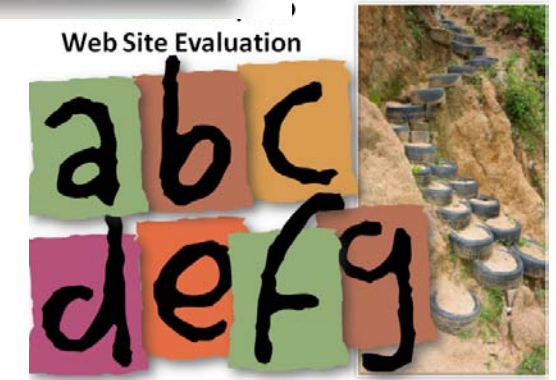
Graphics from Microsoft Word 2007